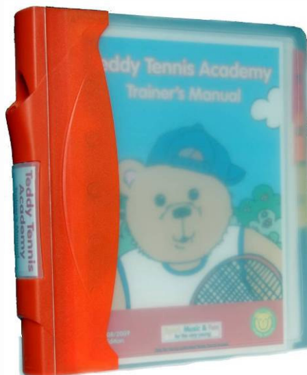
The Teddy Tennis Coaches Manual

Teddy Tennis is a structured teaching programme that is packaged up into a Coaches Manual and includes three core components: Play Sessions, Activities and Music.