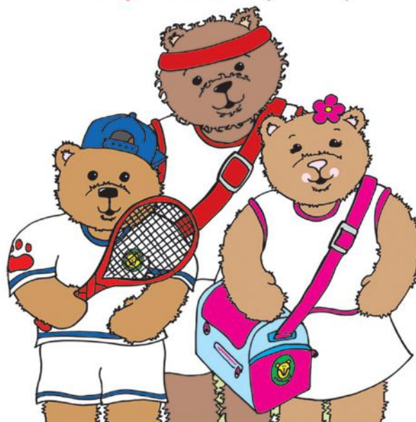
Danny, Johnny Mac and Chloe Bear

The bears (known as Cub Cadets ) play an important role at the Teddy Tennis Academy in setting a fine example of behaviour, what to eat and drink as well as being very good at playing Teddy Tennis. They act as excellent role models.