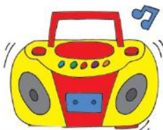
Teddy Tennis CD Player

Teddy Tennis is a fantastic new approach for teaching young children aged 3, 4 and 5 years to play tennis; it is FUN to do and it is loved by everyone. It works by using pop music and pictures... but its not just any old music nor any old pictures!